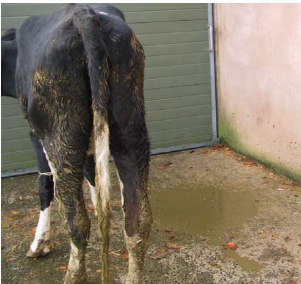
Fig 5: There is loss of appetite with sudden and profuse green diarrhoea which affects most animals within the group