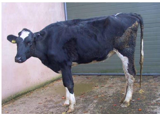
Fig 2: Parasitic gastroenteritis affecting a growing dairy heifer grazing contaminated pasture during its first summer at grass

In spring-calving beef herds, early season pasture contamination of developing larvae is ingested by immune adult cows which results in restricted egg output and subsequent low larval challenge to the calves later in the grazing season. Autumn-born beef calves graze little before housing and are generally weaned at turnout before larval challenge occurs during the next summer. Problems could arise when these weaned beef calves graze contaminated pasture during their second season if they have not gained sufficient immunity as young calves during the previous autumn.