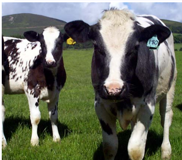
Fig 1: Parasitic gastroenteritis is more often encountered in dairy calves grazing contaminated pasture during their first season.