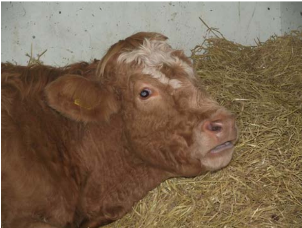
Fig 7: Cattle severely affected by lungworm may be reluctant to move, hold their head down, neck extended, and cough frequently.

Early clinical signs in growing cattle (and dry dairy cows) include an increased respiratory rate at rest, but more noticeable, frequent coughing especially after short periods of exercise. Severely affected cattle may be reluctant to move, stand with their head down, neck extended, and cough frequently.