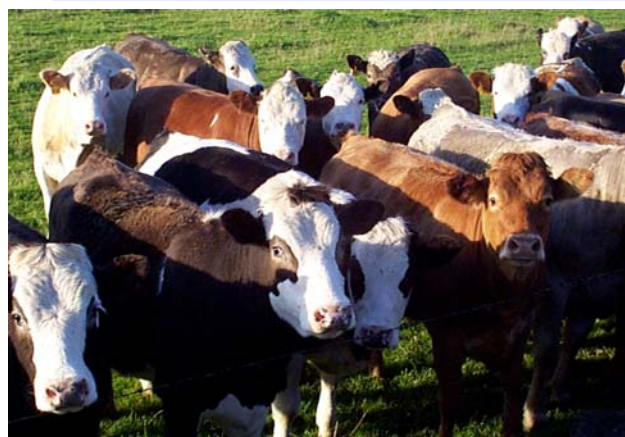
Fig 3: Parasitic gastroenteritis is more often encountered in weaned autumn-born beef calves grazing contaminated pasture during their second season.