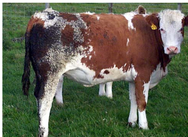
Fig 4: Parasitic gastroenteritis in a weaned autumn-born beef yearling grazing contaminated pasture during its second season.