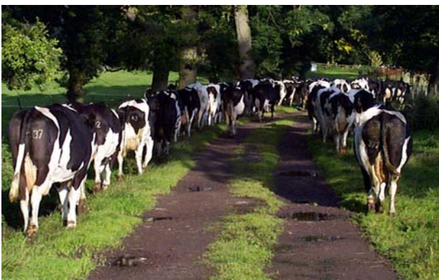
Fig 8: In the dairy herd, a reduction in bulk tank is noted along with frequent coughing when cows are walking to and from the milking parlour.

In the dairy herd, a reduction in bulk tank is noted along with frequent coughing when cows are walking to and from the milking parlour. Infection of susceptible cattle can result in a dramatic reduction