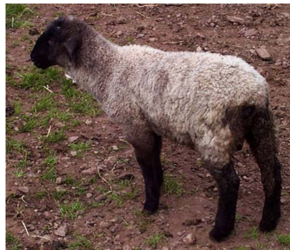
Fig 3: Sheep should be moved from infested pastures whenever possible and treated with an anthelmintic immediately as directed by a veterinary surgeon.