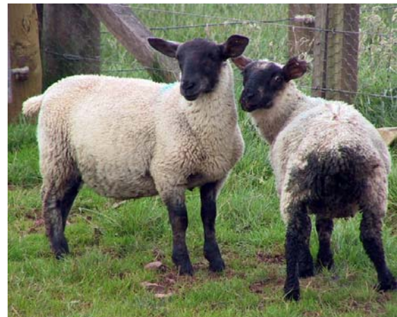
Fig 2: Lambs that survive suffer a marked check in growth rate.