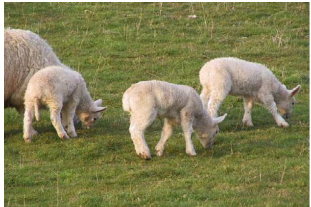
Fig 6: Nematodiosis only results when the mass hatch coincides with grazing activity of young susceptible lambs.

anthelmintics has led to resistance in certain classes of drugs – an integrated approach to parasite control is the best approach and must be planned for the whole farm as part of the flock health plan.