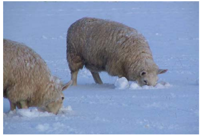
Fig 5: The infective larval stage is very resistant to desiccation and low temperatures and is able to survive the winter on pasture still within the egg.

Anthelmintic treatment is relatively inexpensive (2 pence to 20 pence depending upon class of anthelmintic chosen) but drenching is time consuming especially when attempting to gather large numbers of young lambs from a semi-extensive grazing system. Over-use of