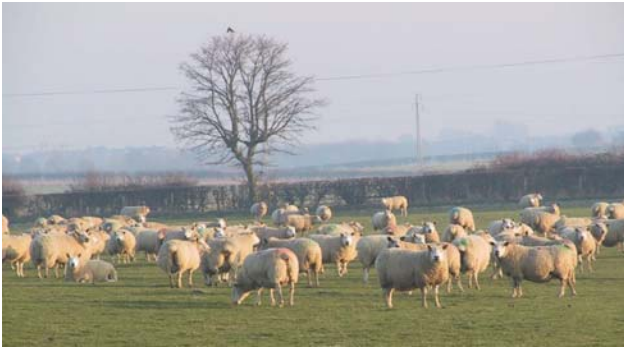
Fig 4: Prevention is based upon avoidance of pastures grazed by lambs during the previous grazing season.

this simultaneous hatch occurs every year on permanent pasture, nematodiosis only results when the mass hatch coincides with grazing activity of young susceptible lambs.(Fig 6) Warm spring weather results in larvae hatching en mass before lambs start grazing, while in cold spring weather hatching is delayed and lambs are becoming age-immune from three months-old when they ingest larvae.