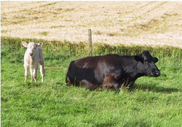
Fig 1: Milk fever, although more common in dairy breeds, can also affect older beef cows (fourth calvers or older) especially dairy crosses (e.g Limousin x Holstein), again more common in autumn calving cows (note the ripening spring barley in the background).

The average annual incidence of milk fever in UK dairy herds is estimated to be approximately 7-8 per cent but individual farms may have a much higher prevalence when calving at pasture. Milk fever is more common in older dairy cows but can also affect older beef cows (fourth calvers or older) especially dairy crosses (e.g Limousin x Holstein), again more common in autumn calving cows.