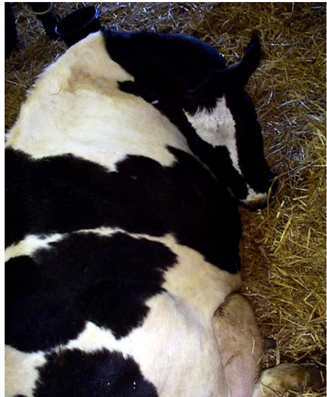
Fig 3: The clinical signs progress to muscle weakness and the cow lies down with the head held against the chest.

The clinical signs progress to muscle weakness and the cow lies down with a characteristic kink (“S-bend”) in her neck, later the head is held against the chest. Gut stasis causes bloat and constipation. Left untreated, the cow becomes comatose and lies on her side. Ruminal bloat and/or paralysis of respiratory muscles cause death in untreated cattle after 12-24 hours.