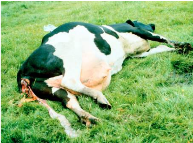
Fig 4: Left untreated, the cow becomes comatose and lies on her side. Ruminal bloat and/or paralysis of respiratory muscles cause death in untreated cattle after 12-24 hours.

Potential complications of hypocalcaemia include uterine inertia (leading to calving problems and/or stillbirth), prolapse of the uterus, inhalation of rumen contents when cast causing pneumonia, and pressure damage to nerves and muscles.