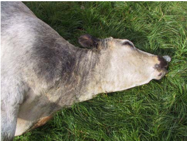
Fig 8: Sudden death due to hypomagnesaemia.

The average annual incidence of acute hypomagnesaemia in the UK is under 1 per cent. Most cases occur in recently-calved beef cows but disease can also occur in dairy cows particularly if unsupplemented during the dry period. There is a range of clinical signs from sub-clinical disease to sudden death. Acute hypomagnesaemia is one of the few true veterinary emergencies.