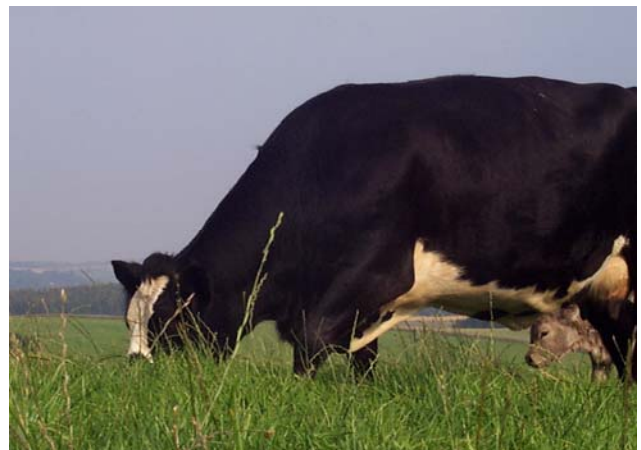
Fig 9: Lush pastures are low in fibre and increase the rate of passage of food material through the rumen reducing time for the absorption.

Factors influencing the availability of dietary magnesium include magnesium levels in the soil and grass which vary considerably. High levels of potassium (application of potash fertilisers) disrupt the absorption of magnesium. High levels of ammonia (from nitrogenous fertilisers) inhibit magnesium absorption. Lush pastures are low in fibre and increase the rate of passage of food material through the rumen reducing time for the absorption.