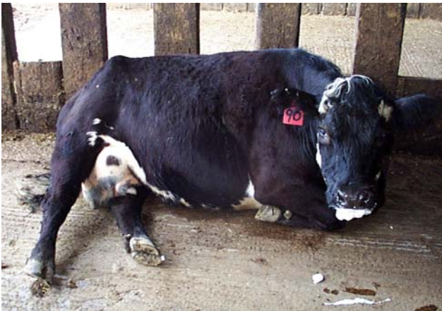
Fig 10: Affected cows become separated from the group and have a startled expression with frequent teeth grinding, an exaggerated blink reflex and frothy salivation.

In acute disease there is initial excitability with high head carriage, twitching of muscles (especially around the head) and incoordination ("staggering gait"). Affected cows become separated from the group and have a startled expression, show an exaggerated blink reflex and frequent grinding of the teeth. There is rapid progression to periods of seizure activity. During seizure activity there is frenzied paddling of the limbs, sudden eye movements, rapid pounding heart, and teeth grinding with frothy salivation.