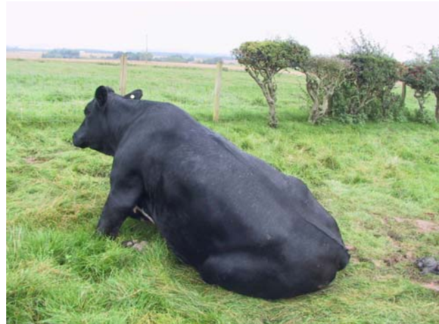
Fig 2: Muscle weakness in a recently calved beef cow with early hypocalcaemia

Clinical signs usually occur within 24 hours after parturition but can occur at or before calving, and in exceptional situations (often very high yielding cow during oestrus) several weeks/months after calving. The clinical signs progress over a period of 12 to 24 hours. There is teeth grinding and muscle tremors, stiff legs, straight hocks and “padding” of the feet when standing during the early stages.