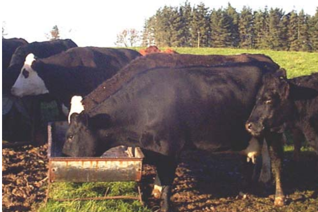
Fig 14: Supplementing autumn-calving beef cows in early October.

The sole water supply can be medicated with soluble magnesium salts such as chloride, sulphate or acetate. Pastures may be dusted during high-risk periods with finely ground calcined magnesite every 10-14 days. Intra-ruminal boluses give a slow release of relatively small amounts of magnesium into the rumen over a period of four weeks. Magnesium salts and minerals are unpalatable therefore ad-lib minerals are not satisfactory. Supplementation is especially important during stormy weather when roughage, such as straw, can be beneficial for beef cows.