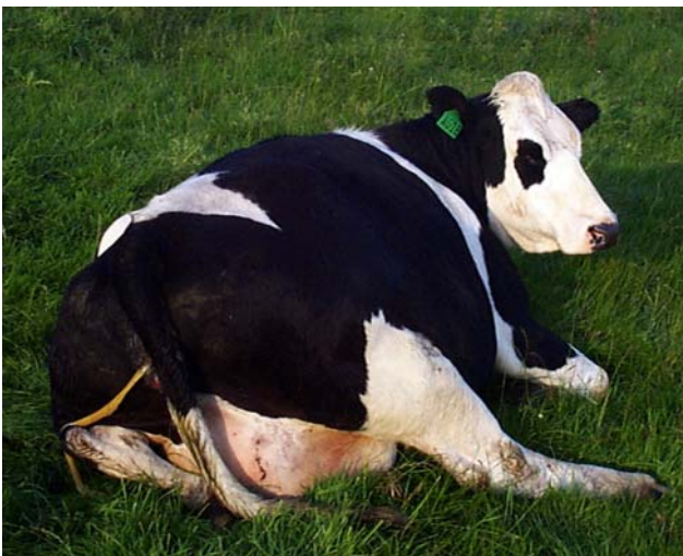
Fig 5: Potential complications of hypocalcaemia include uterine inertia leading to calving problems.

Potential complications of hypocalcaemia include uterine inertia (leading to calving problems and/or stillbirth), prolapse of the uterus, inhalation of rumen contents when cast causing pneumonia, and pressure damage to nerves and muscles.