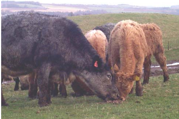
Fig 13: The best method is to use 60g magnesium oxide (calcined magnesite) per cow per day in high-magnesium cobs.

The total diet should contain 2.5g/kg DM of magnesium to meet requirements of the majority of lactating cows at pasture. The best method is to use 60g magnesium oxide (calcined magnesite) per cow per day in high-magnesium cobs. Magnesium salts are relatively inexpensive and the cost of supplementation 100 cows for two months will be less than the loss on one animal due to hypomagnesaemia