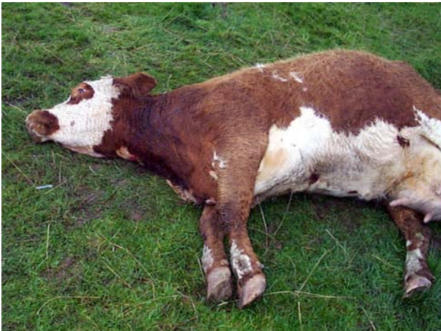
Fig 11: During seizure activity there is frenzied paddling of the limbs, sudden eye movements, and a rapid pounding heart.

Death may follow at any stage. Relapses are common even after apparent correct treatment. The majority of cows in the group may be affected subclinically.