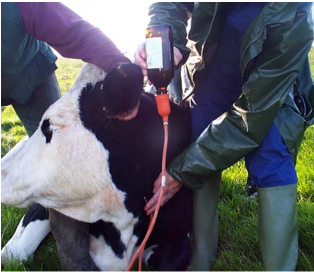
Fig 7: Use a 14 gauge needle and flutter valve with the bottle held 30-40 cm above the infusion site.

Some veterinary surgeons also administer 400ml of 40% calcium borogluconate subcutaneously in an attempt to prevent recurrence which can occur in approximately 25% of cases. The cow should not be milked for 24 hours and the calf removed after feeding colostrum.