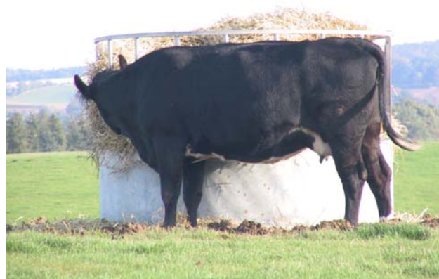
Fig 15: Supplementation is especially important during stormy weather when roughage, such as straw, can be beneficial for beef cows.

The sole water supply can be medicated with soluble magnesium salts such as chloride, sulphate or acetate. Pastures may be dusted during high-risk periods with finely ground calcined magnesite every 10-14 days. Intra-ruminal boluses give a slow release of relatively small amounts of magnesium into the rumen over a period of four weeks. Magnesium salts and minerals are unpalatable therefore ad-lib minerals are not satisfactory. Supplementation is especially important during stormy weather when roughage, such as straw, can be beneficial for beef cows.