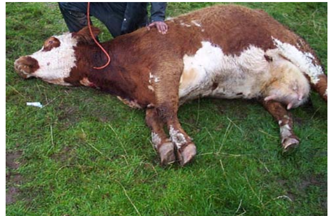
Fig 12: Your veterinary surgeon will likely administer a sedative drug to control the cow's seizure activity and prevent a fatal convulsion which also facilitates intravenous treatment.

It is essential to call a veterinary surgeon to administer a sedative drug to control the cow's seizure activity and prevent a fatal convulsion, and to facilitate intravenous treatment.