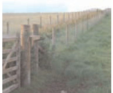
Double fencing helps to prevent neighbouring stock from mixing

Remember that it is much more cost effective to isolate and treat new stock than to risk infecting the whole flock.