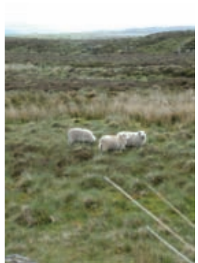
Grazing common ground makes treatment for scab in particular much less effective.