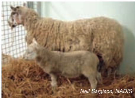
Neil Sargison, NADIS

Scab mites and lice can live off the sheep for at least 16 days. Do not return treated sheep to the contaminated grazing or housing. If possible return to pasture or housing that hasn't held potentially infested or infested sheep for at least three weeks. Similarly don't restock the contaminated grazing or housing for at least three weeks.