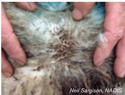
Neil Sargison, NADIS

check stock carefully - nibbling, rubbing, scratching, deranged wool, and areas of wool loss are indications of infestations