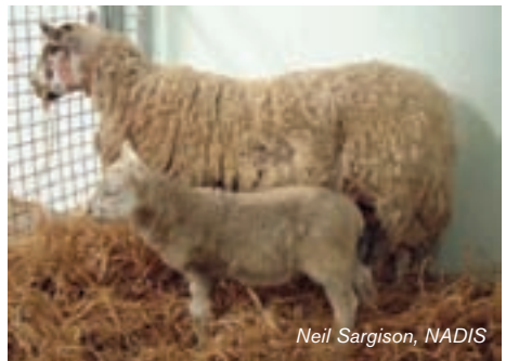
Neil Sargison, NADIS

Scab mites and lice can live off the sheep for at least 16 days. Do not return treated sheep to the contaminated grazing or housing. If possible return to pasture or housing that hasn't held potentially infested or infested sheep for at least three weeks. Similarly don't restock the contaminated grazing or housing for at least three weeks.