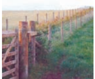
Double fencing helps to prevent neighbouring stock from mixing

Remember that it is much more cost effective to isolate and treat new stock than to risk infecting the whole flock.