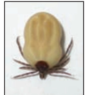
Ticks feed on blood and can transmit infections to sheep and to humans.

A recent survey* conducted by HCC indicated that Welsh producers experience problems with ectoparasites and the majority of respondents routinely treat their sheep for ectoparasites.