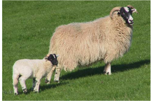
Fig 12: Joint ill affecting the right hock (and possibly other joints).