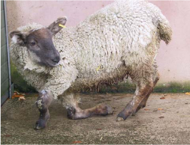
Fig 14: Lambs with polyarthritis that continue to show moderate to severe lameness after two courses of antibiotic therapy must be euthanased for welfare reasons.