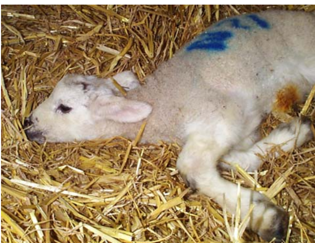
Fig 2: Watery mouth disease can quickly progress to coma and death.

Watery mouth disease is commonly encountered in twins but especially triplet lambs aged 12 to 36