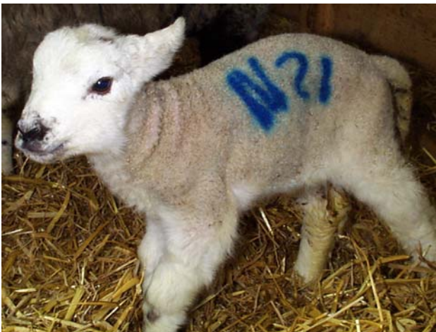
Fig 1: Lambs with watery mouth are dull, lethargic, depressed and reluctant to suck.

Initial contamination of the lambs' gut results from a high environmental bacterial challenge from dirty wet conditions in the lambing shed and pens, and ewes with faecal staining of the wool of the tail and surrounding the perineum. Colonisation of the gut and rapid bacterial proliferation is facilitated by inadequate and/or delayed colostrum ingestion especially in small weakly triplets, and poorly fed ewes in low body condition with insufficient colostrum accumulation.