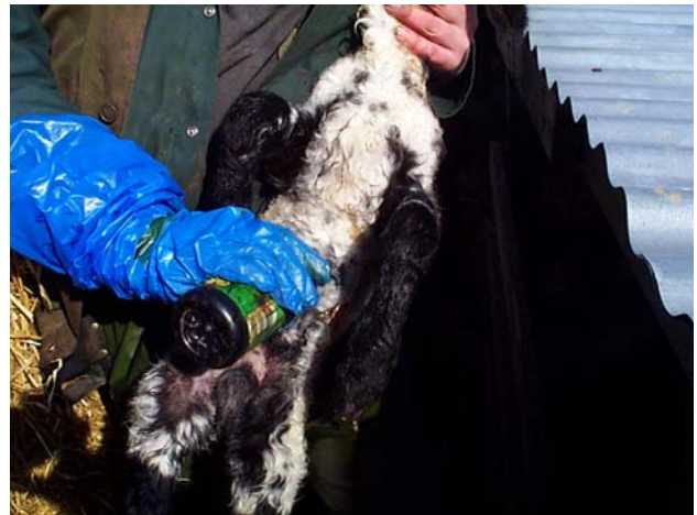
Fig 8: The umbilicus (navel) must be fully immersed in strong veterinary iodine BP within the first 15 minutes of life and repeated 2 to 4 hours later.

birth, and again 2 to 4 hours later when the shepherd checks that the lambs have sucked colostrum as outlined earlier. Note that all these procedures can be fitted into a routine such that none is overlooked.