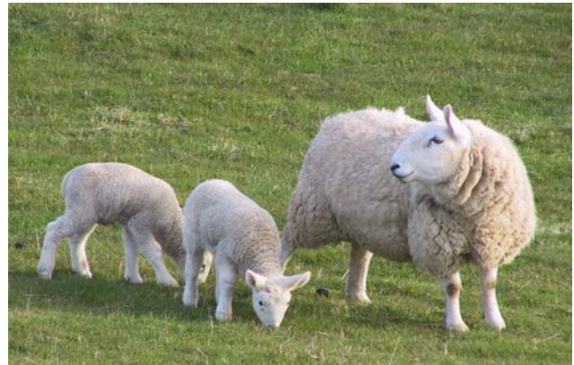
Fig 13: After only one week lambs with polyarthritis are smaller (lamb on left) than their co-twin and in poorer body condition.

Lameness affecting a single leg may result from a foot abscess or interdigital lesion. Dog, fox and possibly badger bites are very uncommon. Trauma to joints may cause marked lameness; the stifle is the most commonly injured joint.