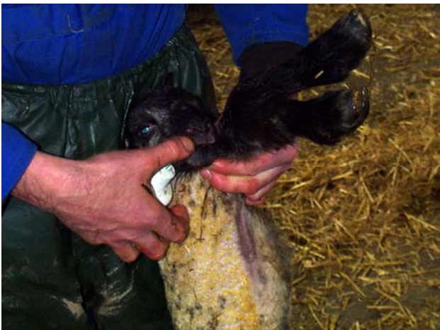
Fig 3: Controlling watery mouth by administration of an oral antibiotic preparation within the first 15 minutes after birth to limit bacterial colonisation of the gut.

The single most effective means of controlling watery mouth affecting neonatal lambs on commercial sheep units is the administration of an oral antibiotic preparation within the first 15 minutes after birth to limit bacterial colonisation of the gut. On most farms it should be possible to delay the prophylactic use of oral antibiotics in lambs until the second half of the lambing period.