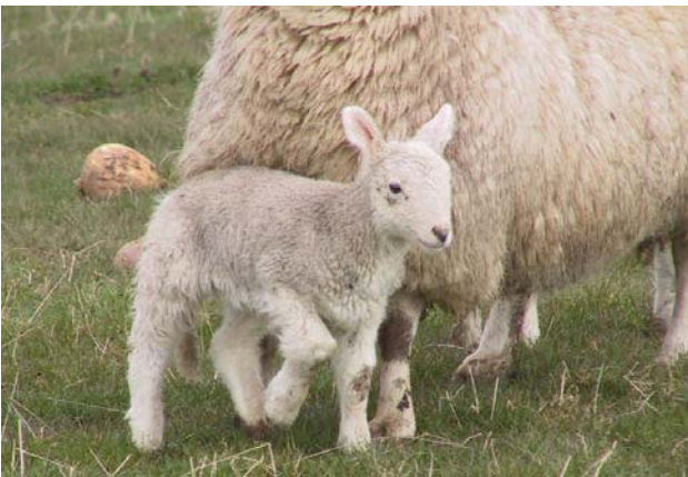
Fig 11: Severe lameness of the right carpus of 5-7 days' duration. Note the lamb's poor body condition and open fleece. Click video below

Streptococcus dysgalactiae infections are acquired during the first few days of life with lameness visible from five to 10 day-old. The number of infected joints is variable; typically only one joint is affected in approximately 50 per cent of lambs with 2 to 4 joints in the remainder. The joints most commonly affected, with decreasing frequency, are the carpal joints, hock, fetlock, and stifle joints. The affected joint(s) are swollen, hot, and painful. Infection causes considerable muscle wastage. After only one week lambs with polyarthritis are smaller than their co-twin and in poorer body condition.