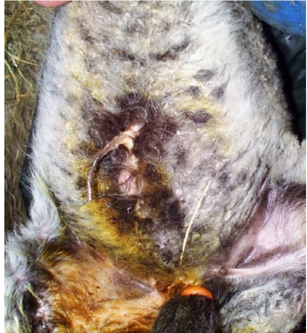
Fig 4: The iodine solution has not been correctly applied to the umbilicus.

consequences for the lamb may not be fully appreciated until some weeks later after a considerable period of suffering (hepatic necrobacillosis).