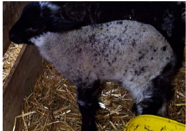
Fig 5: This lamb with septic peritonitis appears very dull and weak and stands with its back arched.

The clinical signs vary with the extent and nature of the peritonitis. Lambs which develop septic peritonitis appear very dull and weak within the first five days of life. They stand with their back arched and their heads held lowered and spend long periods lying in the corner of the pen. The rectal temperature may be subnormal. These lambs do not suck but increasing exudation in the peritoneal cavity, causing moderate distension, contrasts with the lamb's gaunt appearance and expression. Affected lambs rapidly become dehydrated and die within a few days of clinical signs first appearing.