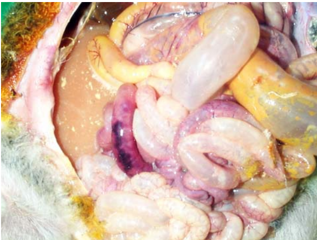
Fig 7: Necropsy of lamb with septic peritonitis – note the large amount of pus (infection) on the left of this image.

Treatment of septic peritonitis and hepatic necrobacillosis is hopeless and lambs should be euthanased for welfare reasons.