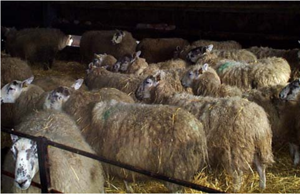
Fig 10: High stocking density but plenty of clean dry straw should reduce bacterial load in the environment.