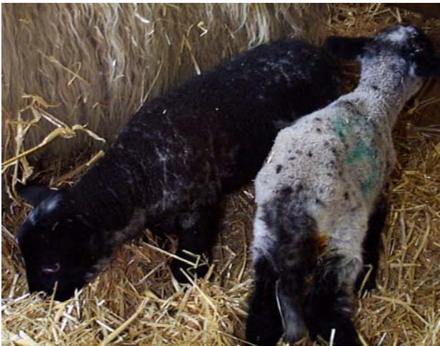
Fig 6: Comparison between healthy five day-old twin (left) and litter-mate with septic peritonitis (right).