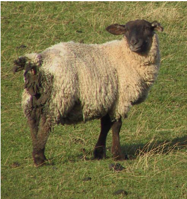
Parasitic gastro-enteritis affecting growing lambs from mid-summer onwards