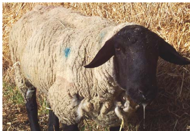
Haemonchosis in a Suffolk shearling - ingestion of large numbers of larvae over a short period of time causes acute disease with lethargy, weakness, and rapid loss of condition.