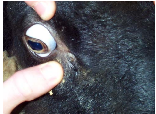
In haemonchosis the most important clinical sign is anaemia.

Haemonchus contortus is becoming a serious threat to intensive sheep production throughout the UK and not just south-east England.