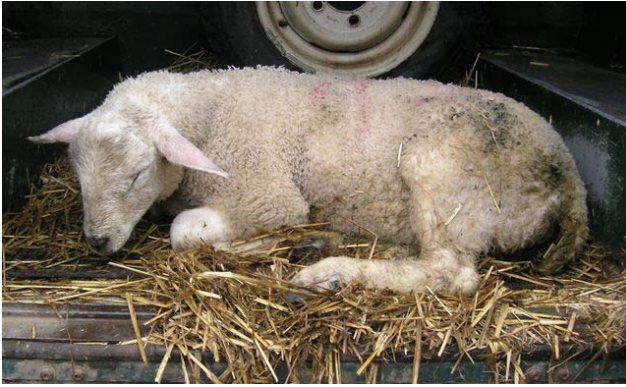
Sudden deaths are not uncommon from nematodiosis in severely affected lambs.