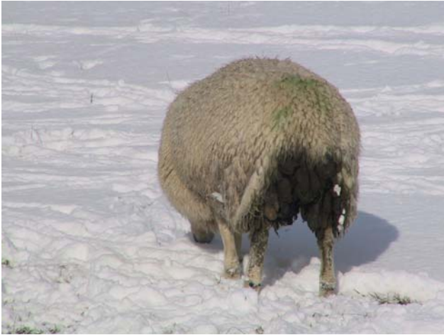
Trichostrongylosis affecting a Scottish halfbred hogg during early winter.