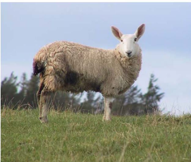
Emaciation caused by failure to control PGE.