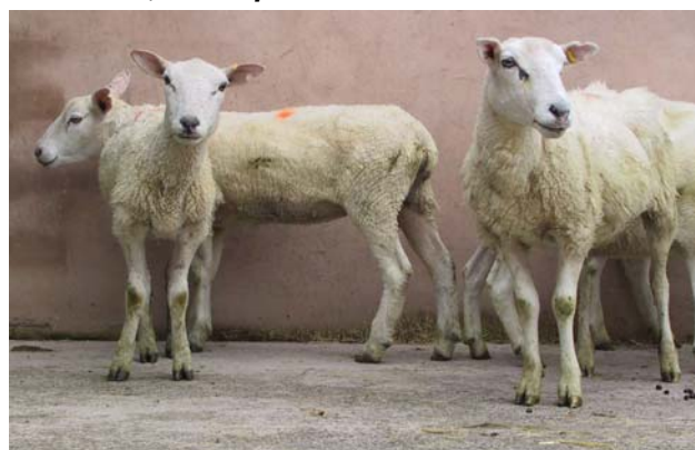
Diarrhoea is not a feature of haemonchosis.