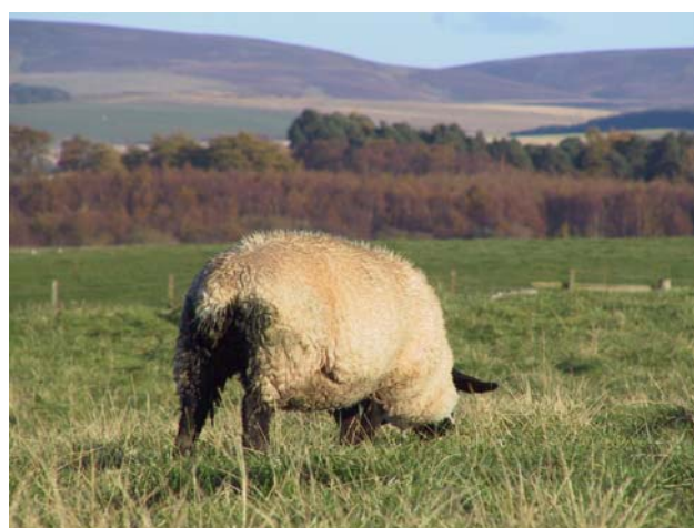
Trichostrongylosis is normally seen during early winter affecting 8 to 10 month-old lambs

Disease is normally seen during early winter, usually affecting 8 to 10 month-old lambs but also yearlings and adult sheep. The most prominent clinical feature is profuse dark-coloured, foul-smelling diarrhoea with much mucus present in the worst affected sheep.