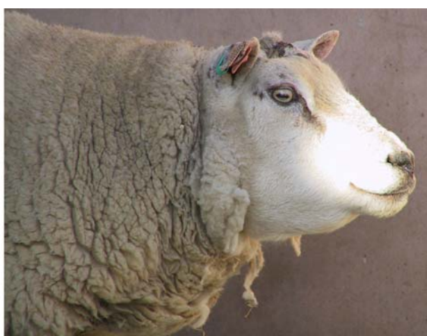
Haemonchosis typically presents with anaemia and submandibular oedema.

As a consequence of its blood feeding, haemonchosis presents with anaemia, submandibular oedema, and increased heart and respiratory rates; diarrhoea is not a feature of this nematode infestation. Ingestion of large numbers of larvae over a short period of time causes acute disease with lethargy, weakness, and rapid loss of condition. This form of the disease is more commonly seen in growing lambs. Ingestion of smaller numbers of infective stages over several weeks to months causes a more general loss of condition progressing to emaciation.