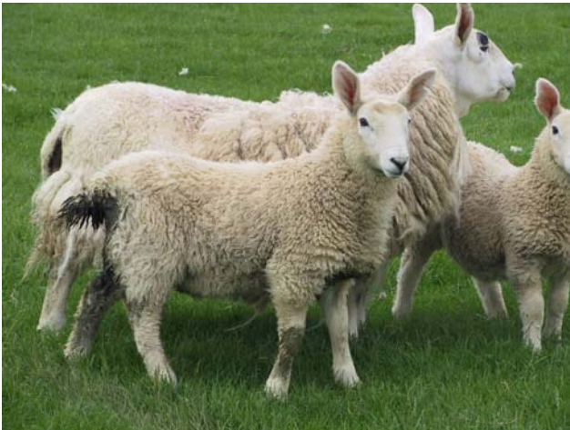
Only lambs are affected with nematodiosis, ewes do not show disease.

Only lambs are affected, ewes do not show disease. There is acute onset of profuse watery diarrhoea in young lambs with faecal staining of the wool of the tail and perineum. The lambs are dull and depressed and rapidly develop a gaunt appearance with obvious dehydration and condition loss. If left untreated during the early stages of disease, deaths occur from dehydration and there is considerable weight loss in the remaining lambs. It is not unusual with severe larval challenge for 5 per cent of lambs to die within a few days.